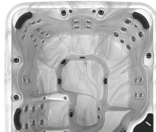
Glacier Mountain Body