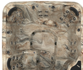
Tuscan Sun Body

Suite Steps in black to match the corners plus matching black Durafab Cover