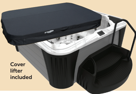
Cover lifter included

Suite Steps with slip resistant step treads, sturdy integrated handrail, side planters/coolers, inside step storage plus convenient quality cover lifter. Weather and fade resistant Durafab cover also included.