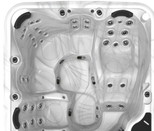
Glacier Mountain Body