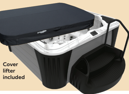
Cover lifter included

Suite Steps with slip resistant step treads, sturdy integrated handrail, side planters/coolers, inside step storage plus convenient quality cover lifter. Weather and fade resistant Durafab cover also included.